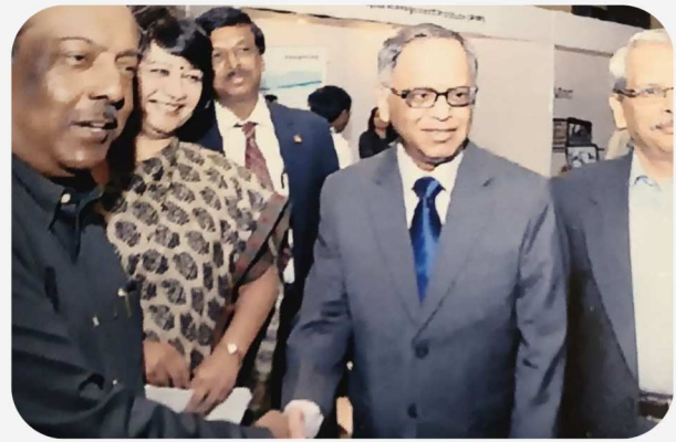
Mr. NR Narayanamurthy @ BMA