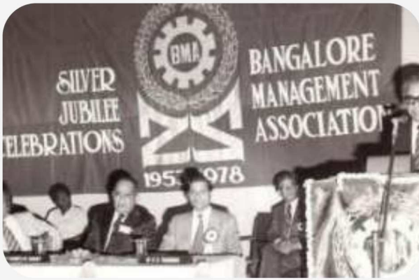
Mr. Peter Drucker @ BMA