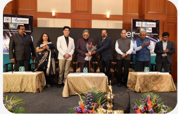
Mr. SM Krishna @ BMA