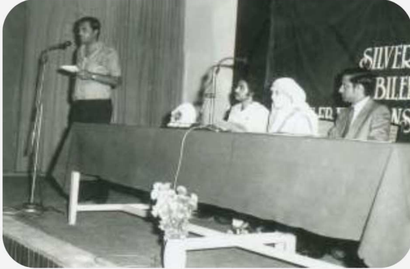
Mother Theresa @ BMA